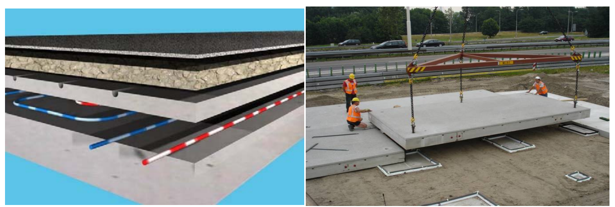
Figure 3. ModieSlab prefabricated concrete pavement.

The temporary bridge concept (Figure 4) involves the placement of a temporary bridge structure to permit traffic to continue to travel, at reduced speed, while an expansion joint is repaired. The "high variant" temporary bridge structure allows sufficient clearance for construction workers to complete pavement and construction joint repairs. The "low variant" version is only slightly above the pavement surface and is used to allowed repairs to properly cure.