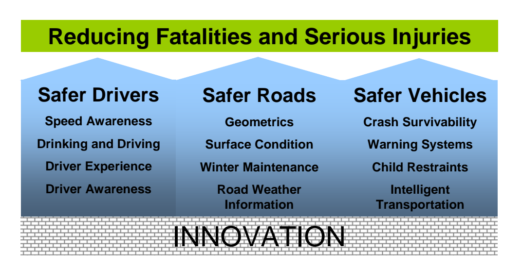
Figure 1. Innovation – The foundation for reducing fatalities and serious injuries.

While the Transport Canada Road Safety Vision 2010 program focuses on safety improvements to vehicles, intelligent transportation systems, driver attitude to speeding, reducing impaired driving, etc., improvements to the transportation infrastructure can also improve the safety of both the drivers and construction workers. Some of the possible ways to achieve these goals are outlined in Figure 1.